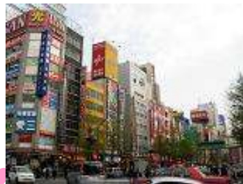
figure-models, video games, animation products.

Introducing many second hand premium products including, product, DVD products and plamode products and anime related